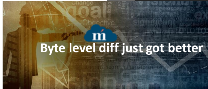
IMAGE DIFFING FOR PATCHING